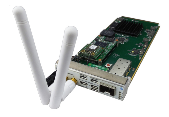
Figure 3: AMC227 with an Antenna